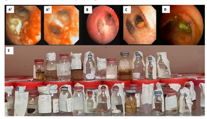
Figure 2: Images of removed foreign body A1: Piece of garlic fully obliterating the left lower bronchus in a 61male emergent rigid year-old patient during bronchoscopy A2: View of patent bronchus following foreign body removal with cryo-probe B : Broken biopsy needle lodged at carinal level during EBUS procedure in a 80-year-old patient which was removed by rigid bronchoscopy following fiberoptic bronchoscopy C: FOB view of medicine in tablet form in right main bronchus D : Entangled cotton threads detected in the right main bronchus in a 60-year-old woman with schizophrenia E : The final destination of foreign bodies (FB) removed out of the lungs: The FB display cabinet in our interventional pulmonology unit

the removed FB were characterized as organic (mainly solid and semi-solid foods), 23 (45.0%) as inorganic and 5 (10.0%) remained unspecified after pathological examination. Inorganic FB were of metallic structure (such as pins, staples, screws) in 13 patients, and non-metallic objects (such as bottle cap, speech apparatus, dental prosthesis, napkin) in 10 patients (Table 3) (Figure 2).